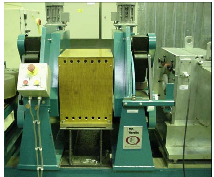
Demagnetizer coil shown above, installed on a test bench as part of an eddy current inspection system at Izhtal bar mill in Russia