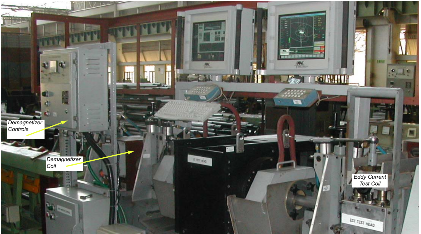
Demagnetizer control unit and coil as part of an eddy current/ ultrasonic test installation at Tube Products of India, a major tube mill in India.