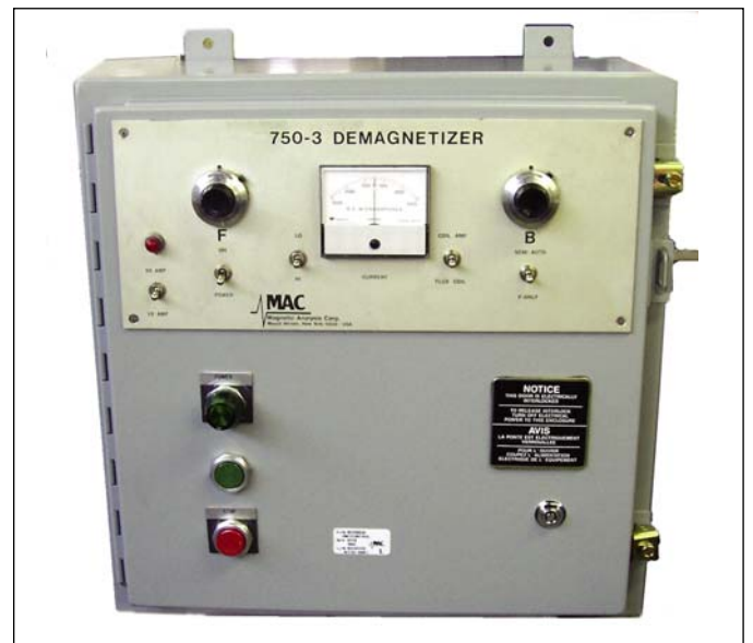
750-3 Demagnetizer Electronic Controls