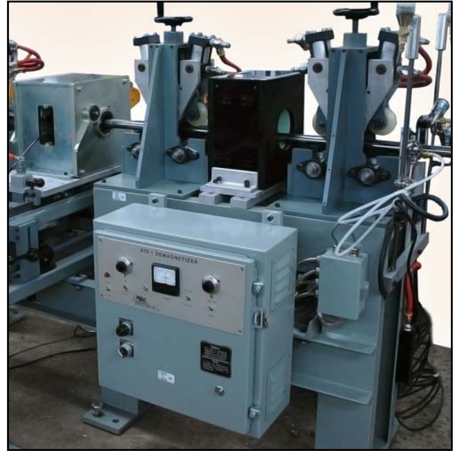
475 Demagnetizer with demagnetizing coil